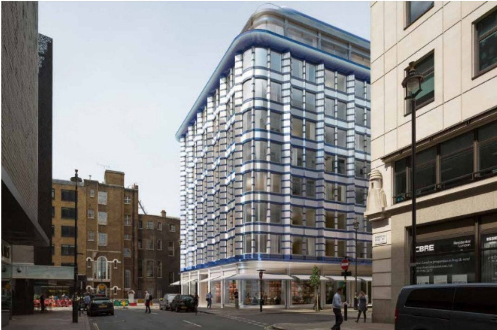
View of Eric Parry's proposals for the Marylebone Lane Hotel

The design and access statement supporting the proposals said the architect had examined the potential of reusing parts of the existing structure for the hotel development.